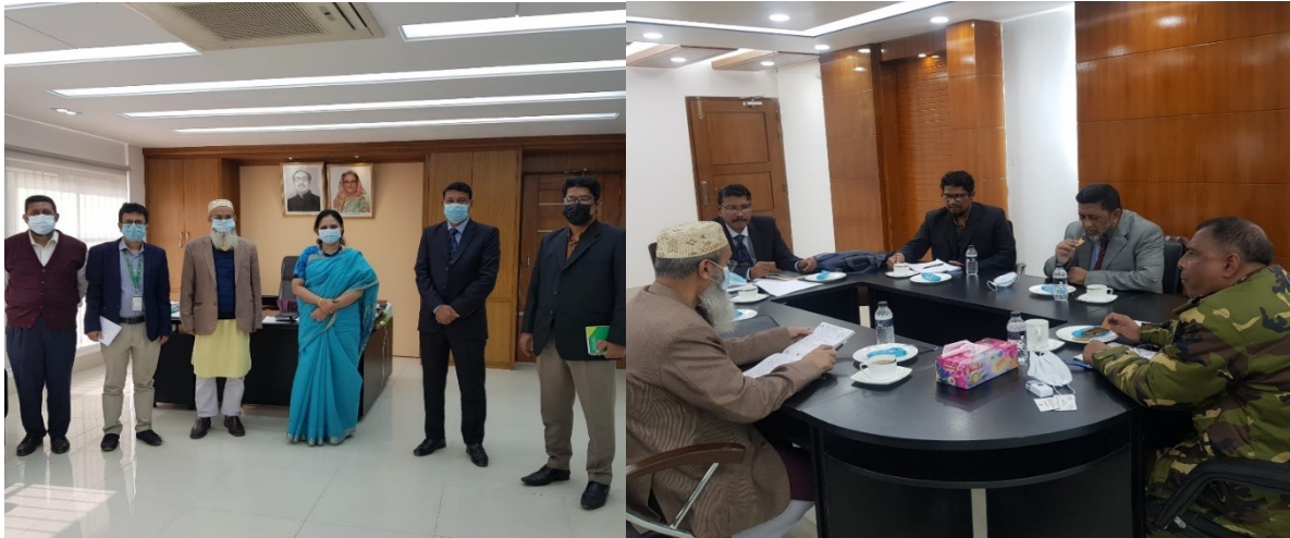
Meeting with National experts and different stakeholders (IEDCR & DGDA)